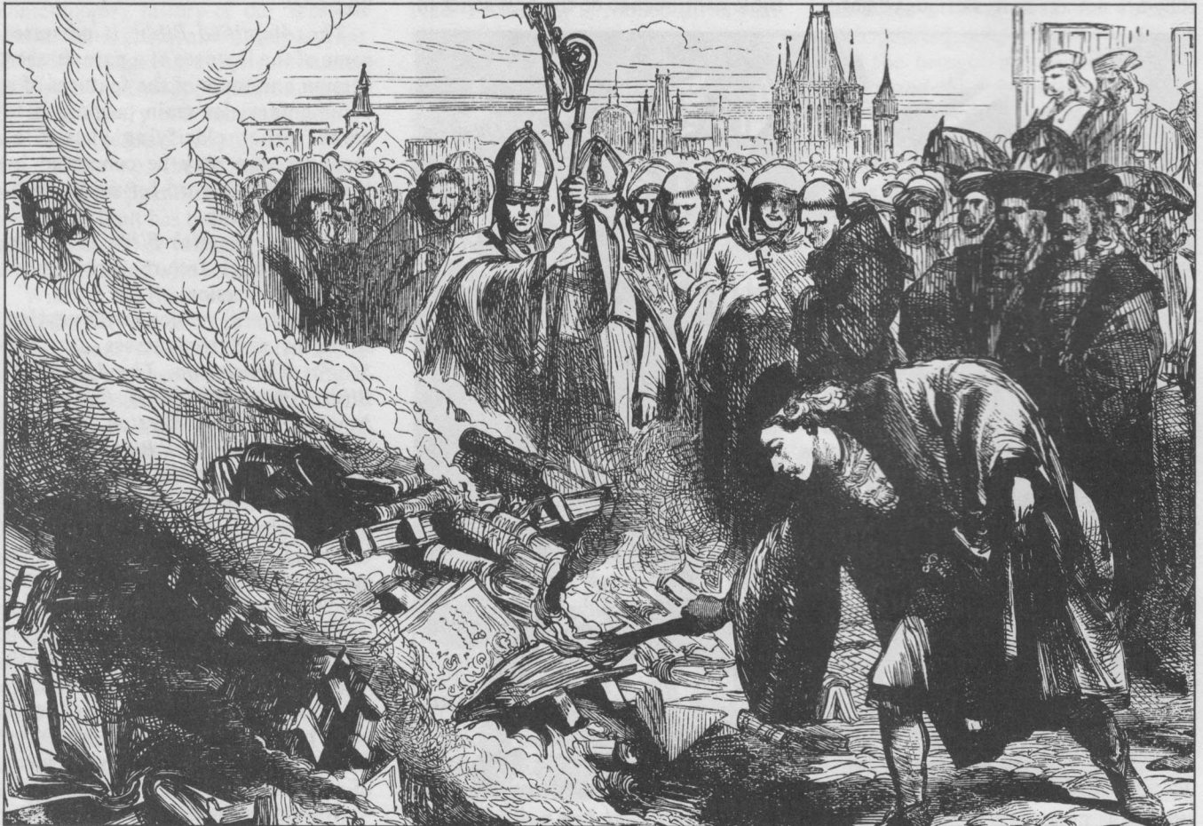
DESTRUCTION of the works of Wyclif at Prague.

Others also found it dangerous to be too closely identified with the translation or circulation of the English Bible. Coverdale narrowly escaped with his life; Cranmer and Rogers were brought to the stake; many others sought safety in flight. Even men who bought or sold these early English Bibles were threatened, sometimes tried for heresy, sometimes put to death. □