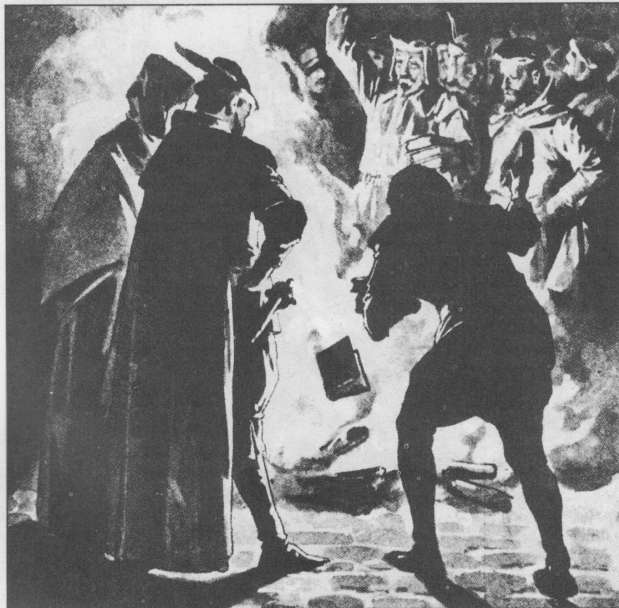
WILLIAM TYNDALE'S translation of the Scriptures are shown being burned. Vigorous measures were taken to find thousands of copies, which were burned in solemn ceremony. This was called "A burnt offering most pleasing to Almighty God."

More complete coverage of the whole subject is available in our free article, "Which Translations Should We Use?"