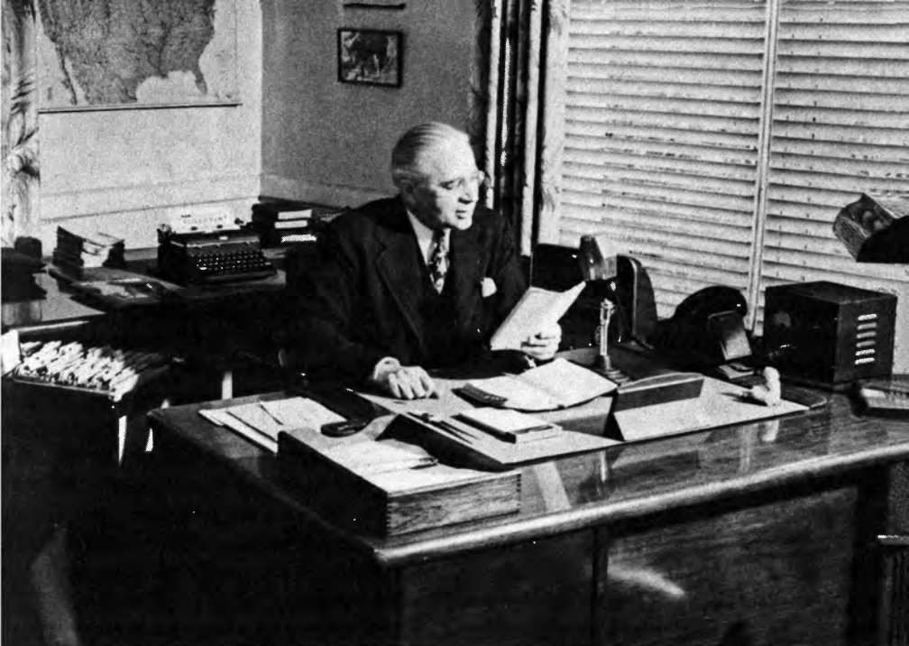
PHOTO SHOWS Herbert W. Armstrong making an early World Tomorrow radio broadcast. From the smallest beginnings, God's work has grown to international scope, carrying the true gospel to all the world as a final end-time witness.