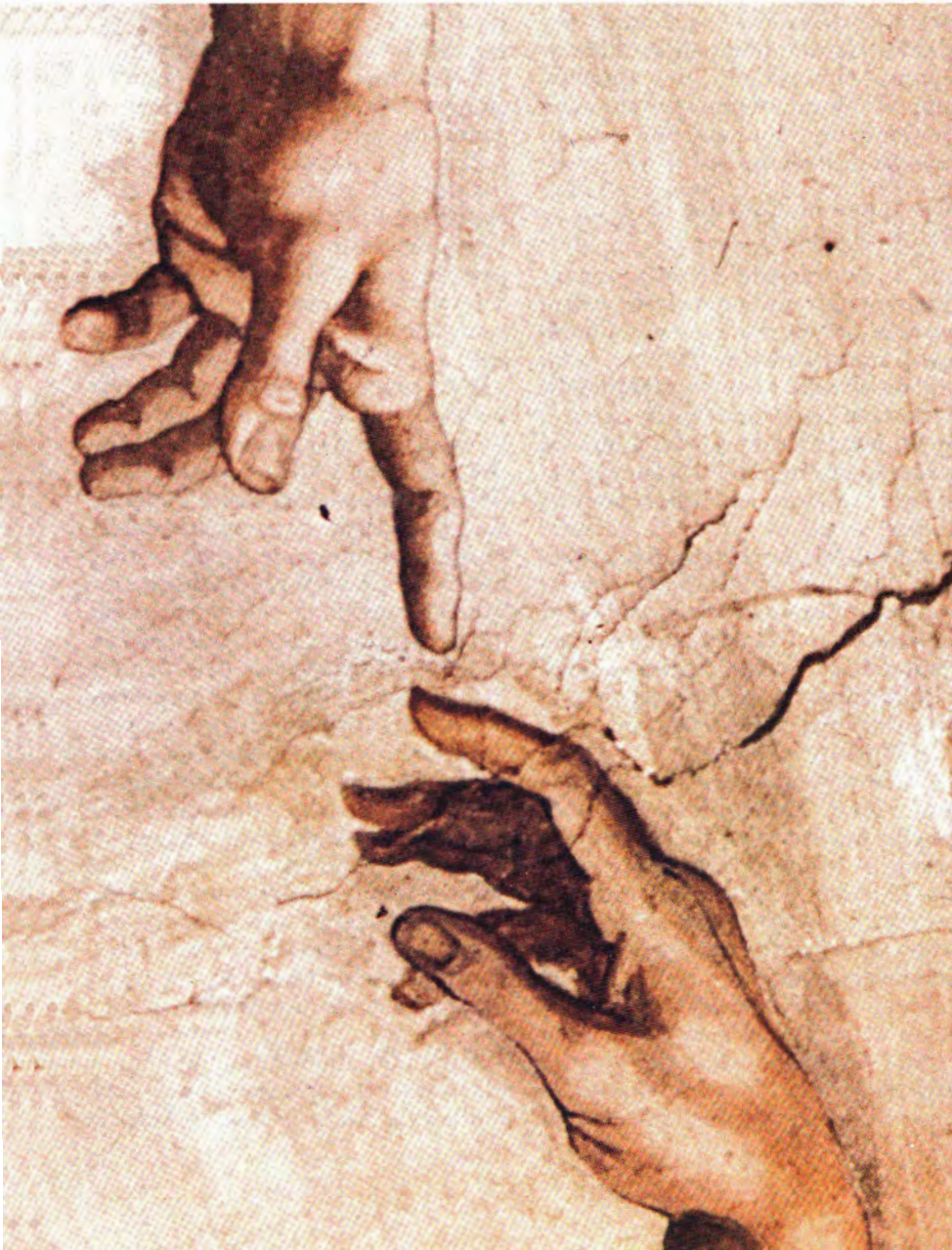
ILLUSTRATION BY MICHELANGELO BUONAROTTI

The term “all things” is translated in Hebrews 1:3, in the Moffatt translation, as “the UNIVERSE.” The entire UNIVERSE was made by Him!