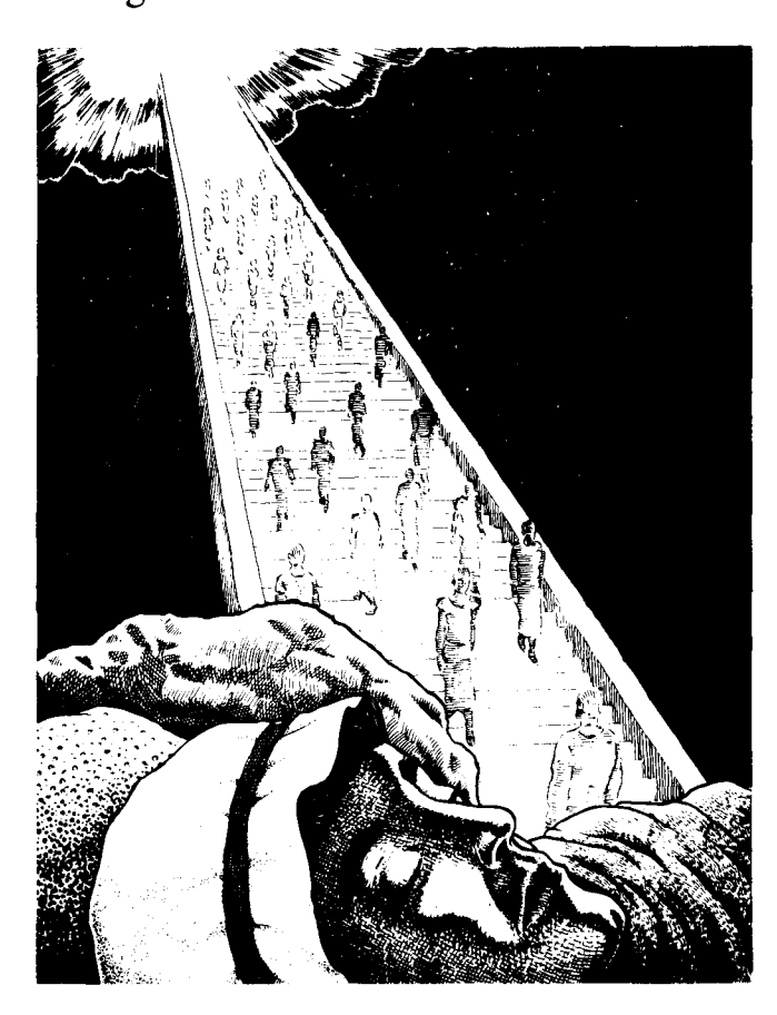
Using a stone for a pillow, the weary Jacob dreamed of a huge stairway descending from heaven.