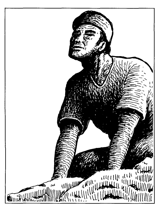
Elijah's servant watched intently from the top of Mt. Carmel for any sign of rain.

falling. Following Elijah's advice, he swiftly got into his chariot, and started out across the plains toward the town of Jezreel, about twenty miles distant.