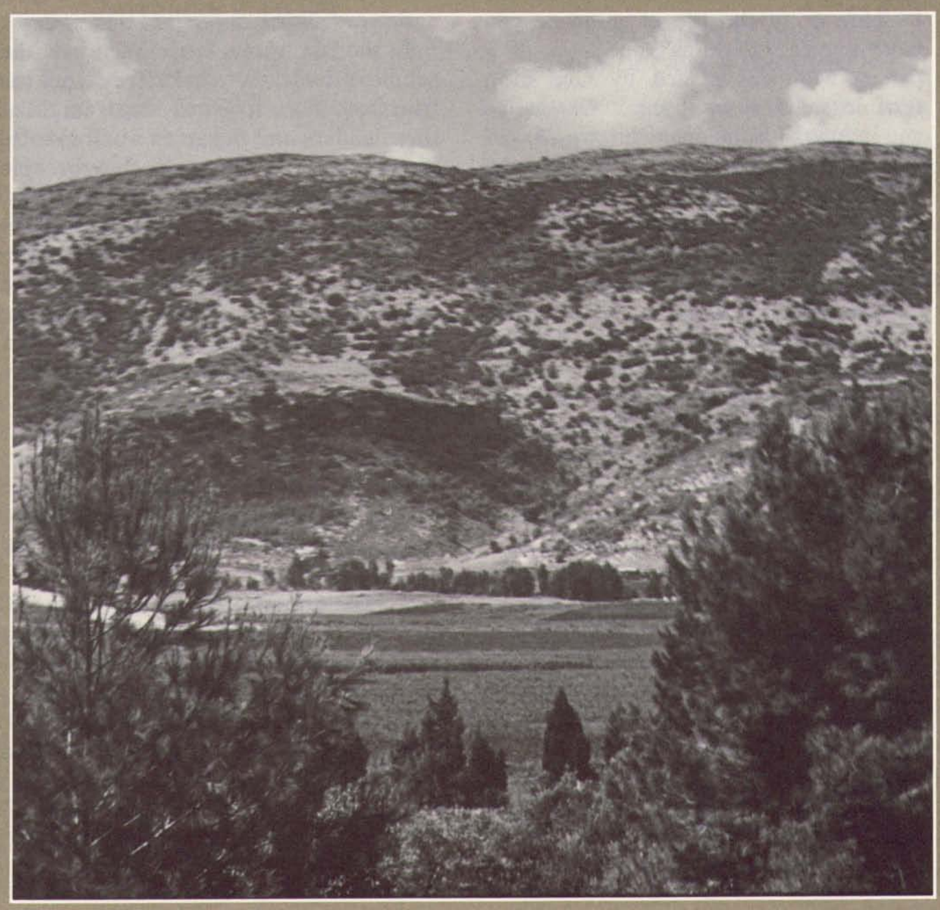
Elijah-A Man of Miracles