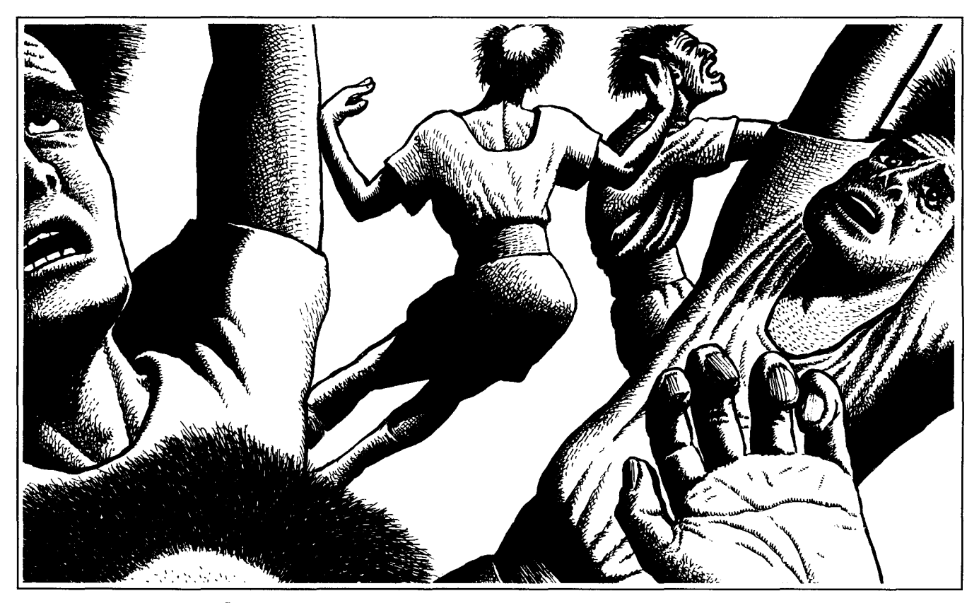
The prophets of Baal danced and sang wildly for hours, hoping their god would answer with fire.