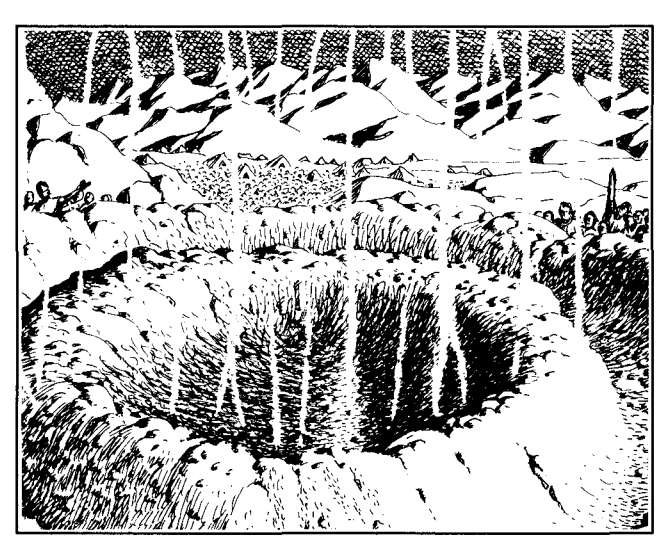
A fireball from God totally consumed Elijah's sacrifice, leaving only a blackened crater.