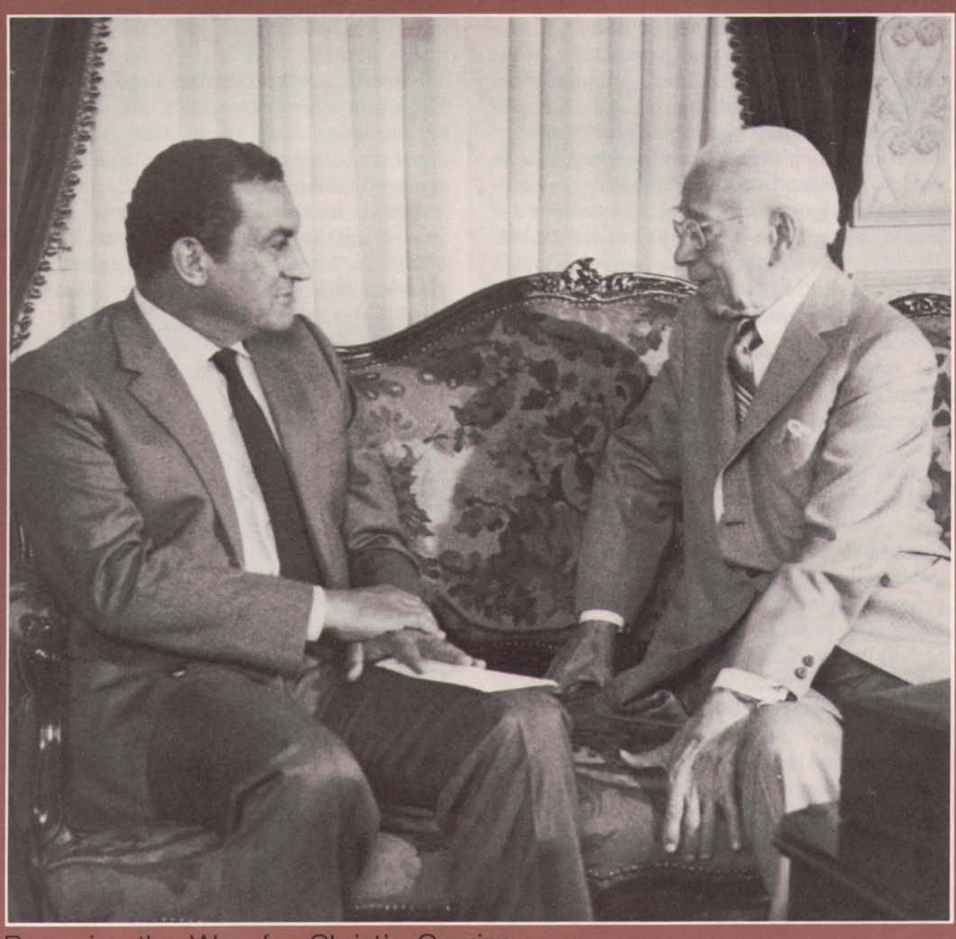
Preparing the Way for Christ's Coming