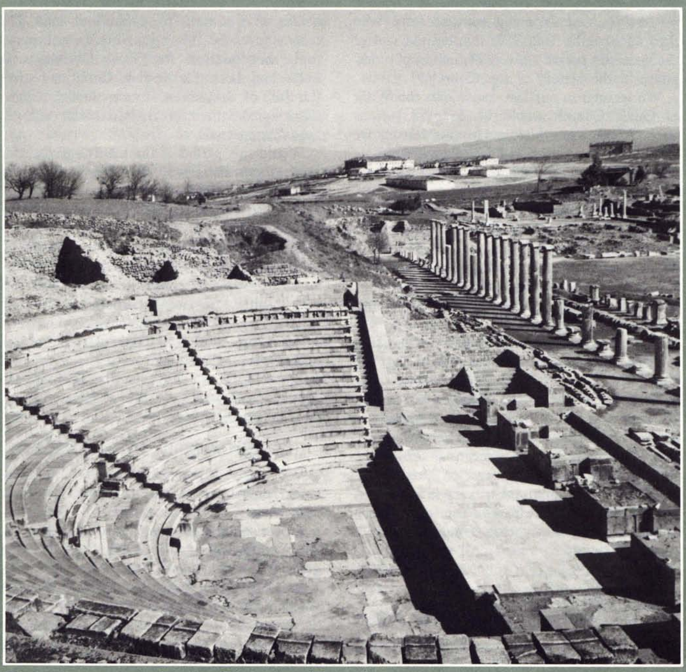
The History of God's Church-Part 2